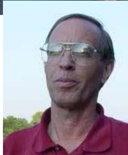
America's Most Wanted (hobbyist)