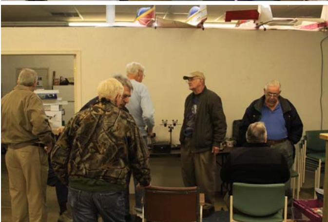
Prize for the next raffle: