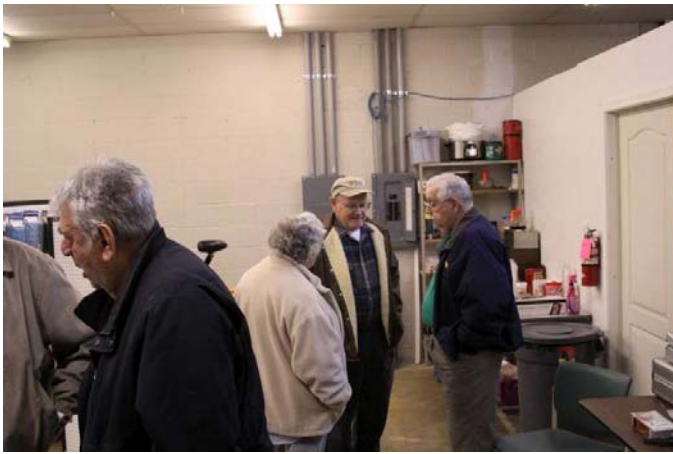
Tuesday morning Coffee Clutch.