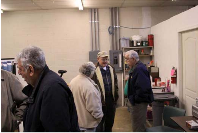
Tuesday morning Coffee Clutch.