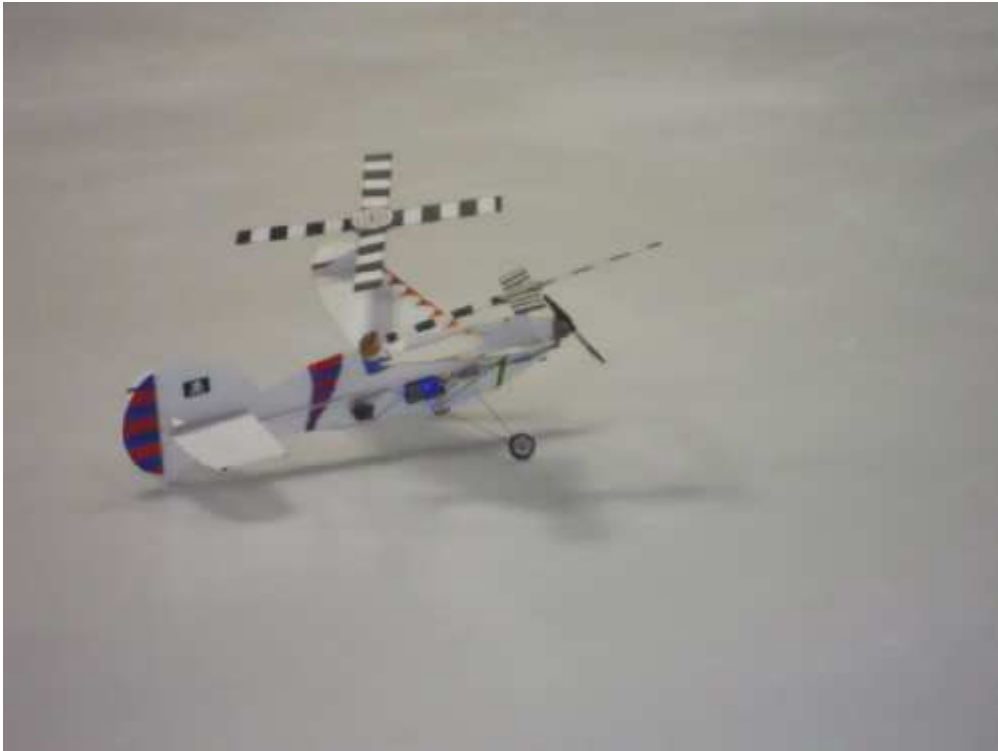
Lots of unique stuff