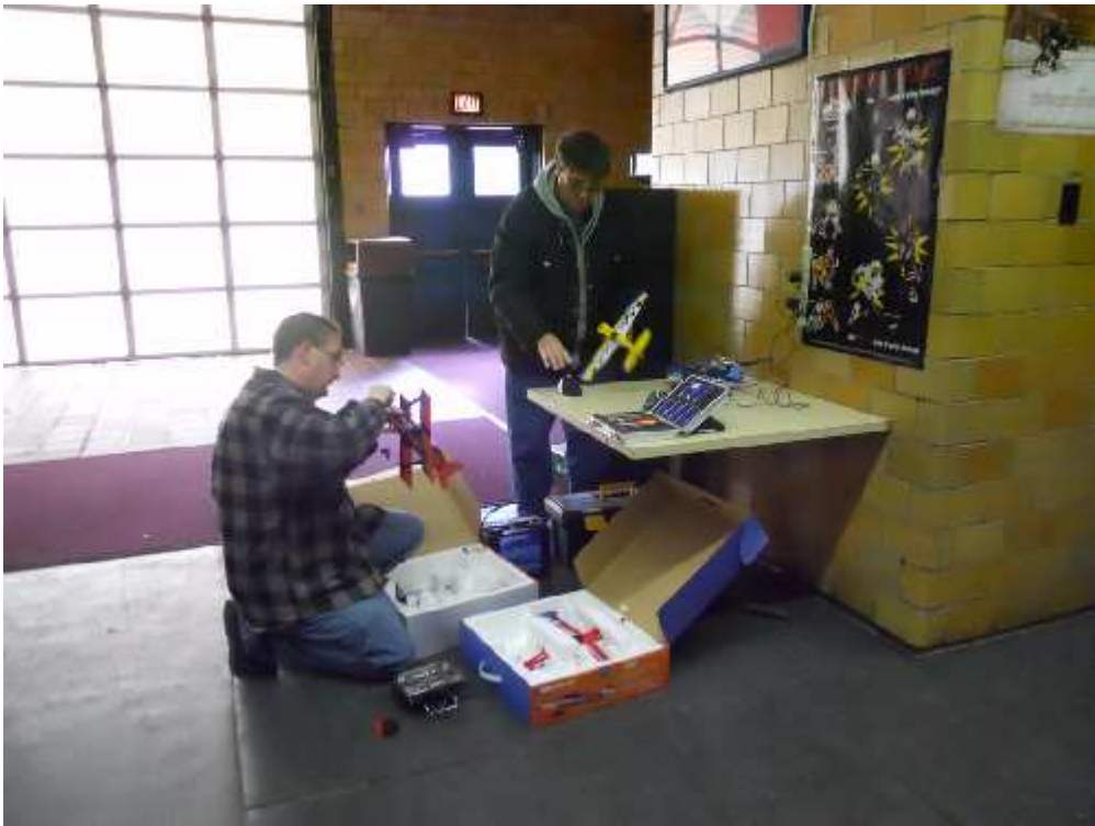
Getting ready for indoor flying