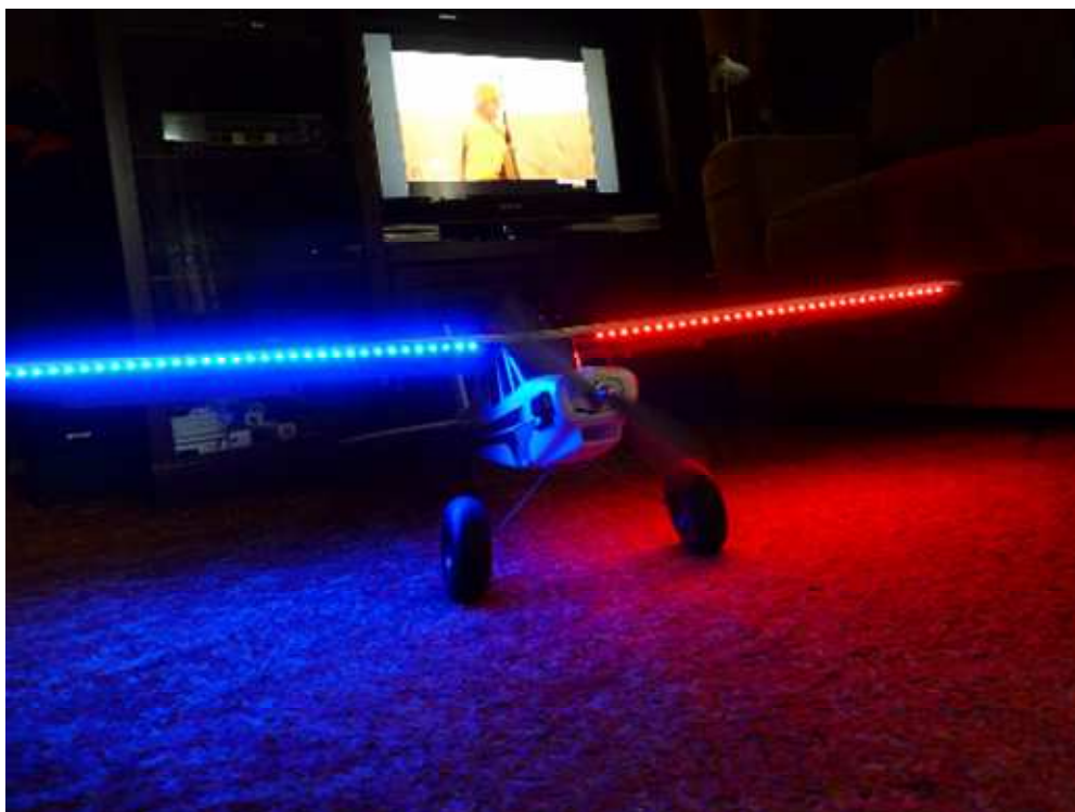
Fun Cub ready to fly in the dark